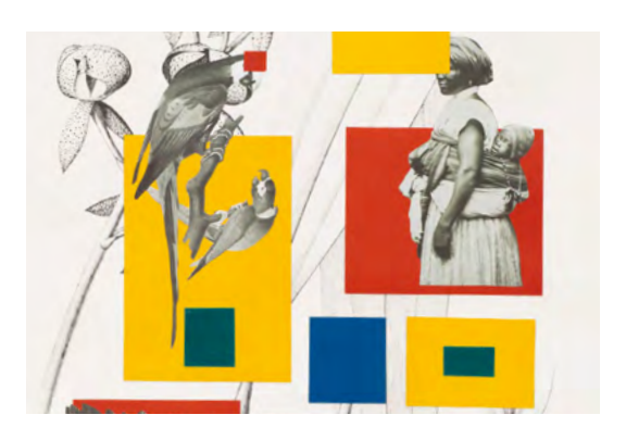
Social Fabric: Art and Activism in Contemporary Brazil