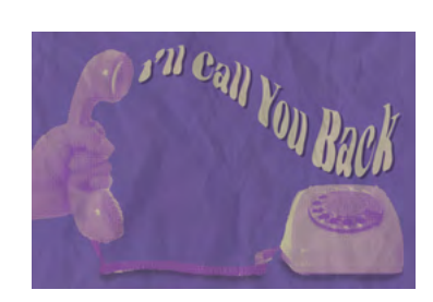
I'll Call You Back 2O23 Senior Art Exhibition